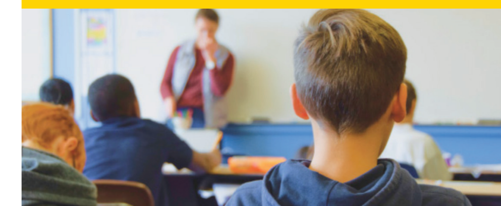
Školní den / Шкільний день