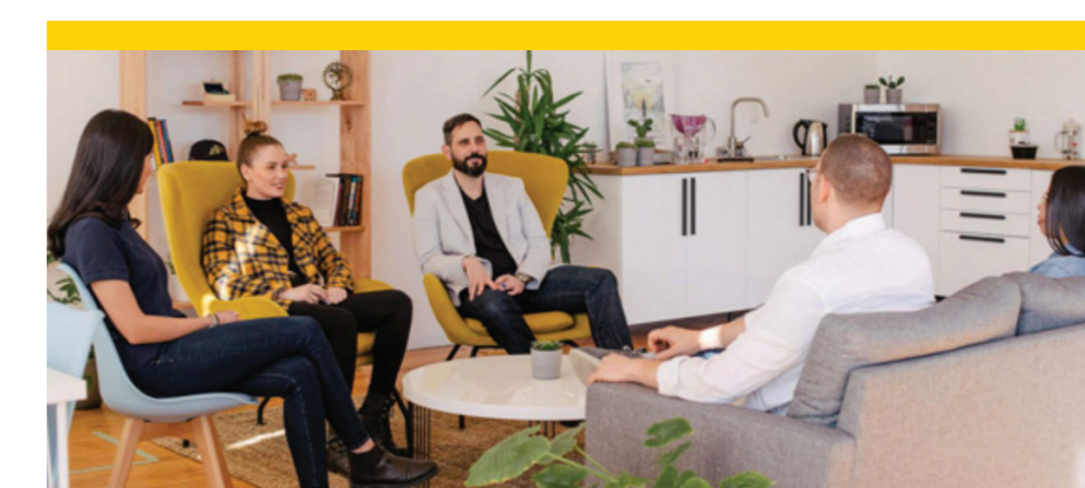
Komunikace s rodiči / Спілкування з батьками

Interactive features such as flip-cards, drag and drop, true or false, and pairing of conversational phrases are used in the linguistic lessons.