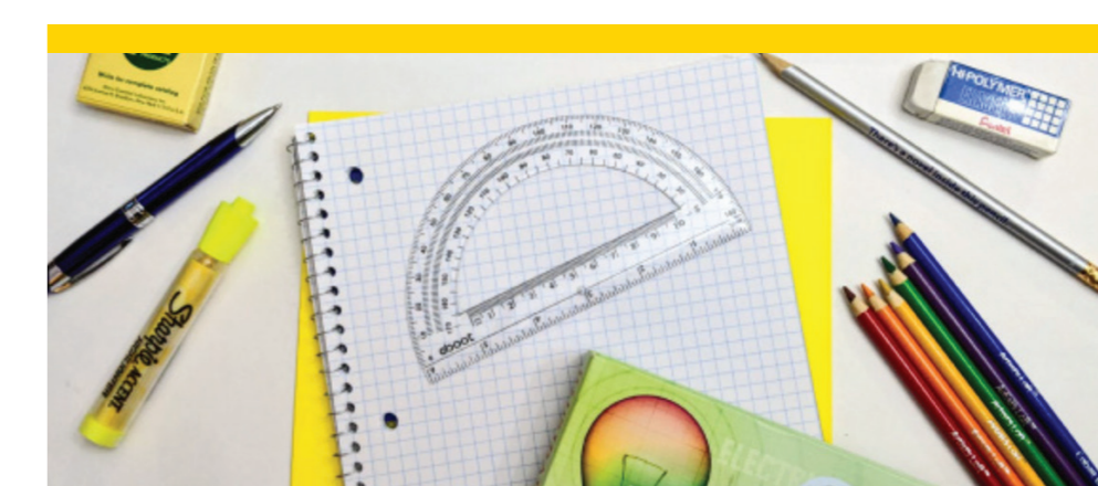
Ve třídě / У класі